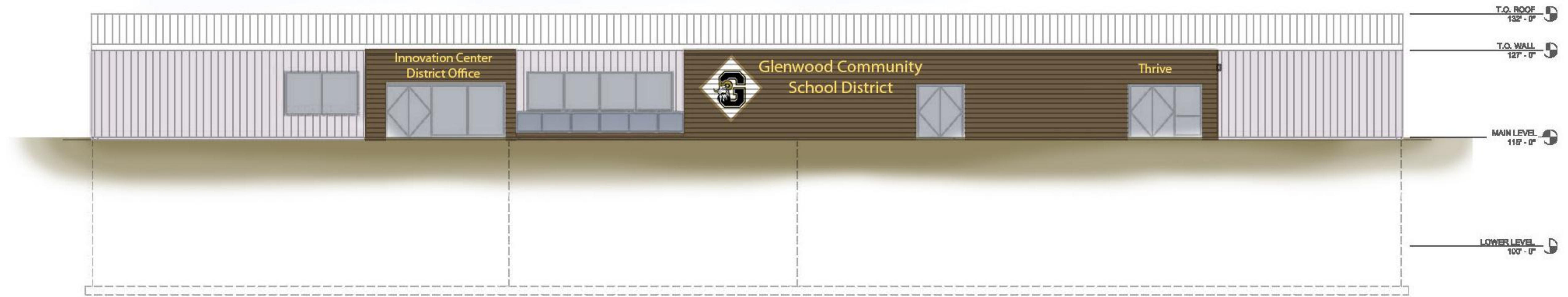
4 SOUTH ELEVATION 1/8" = 1'-0"