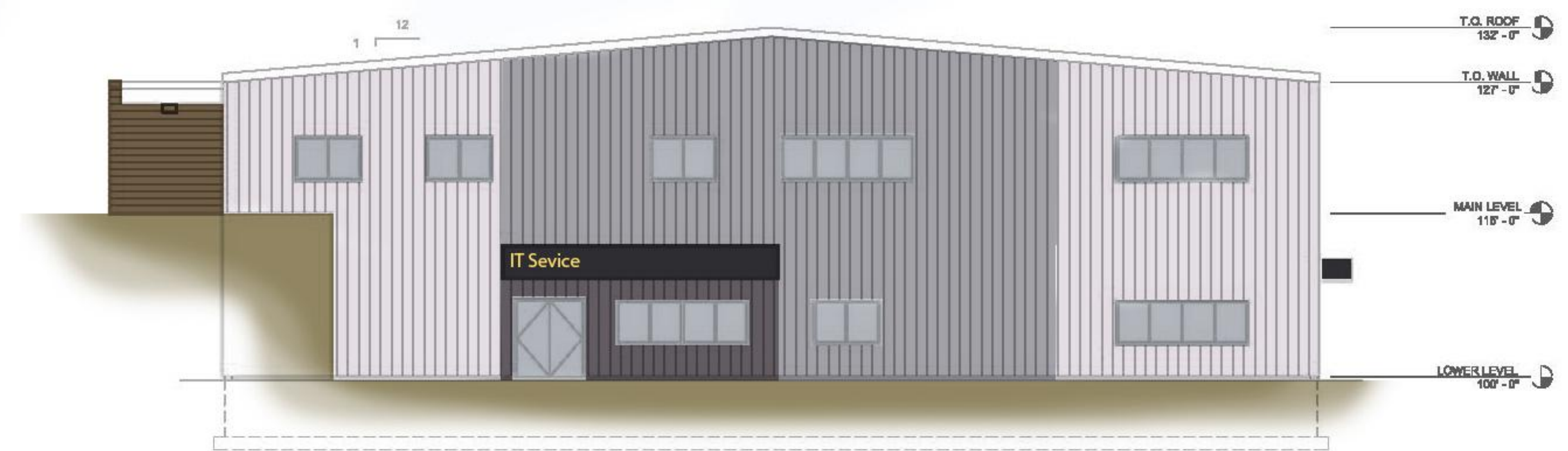
2 EAST ELEVATION 1/8" = 1'-0"