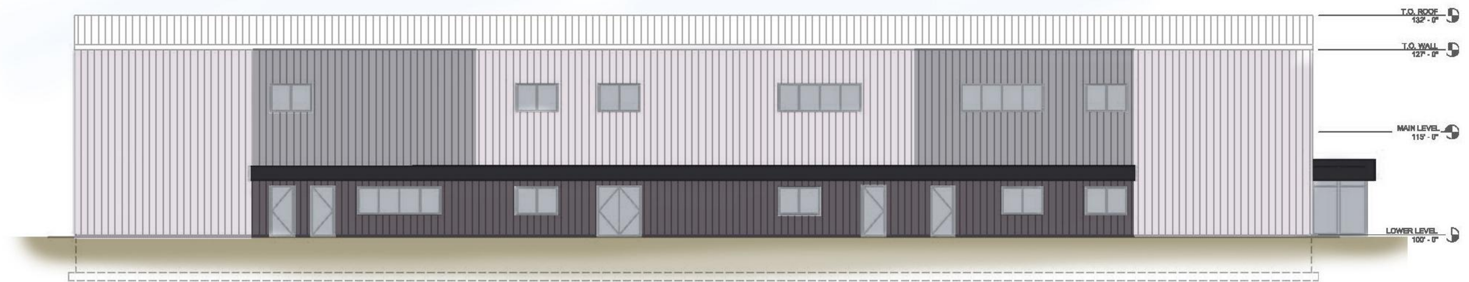
1 NORTH ELEVATION 1/8" = 1'-0"