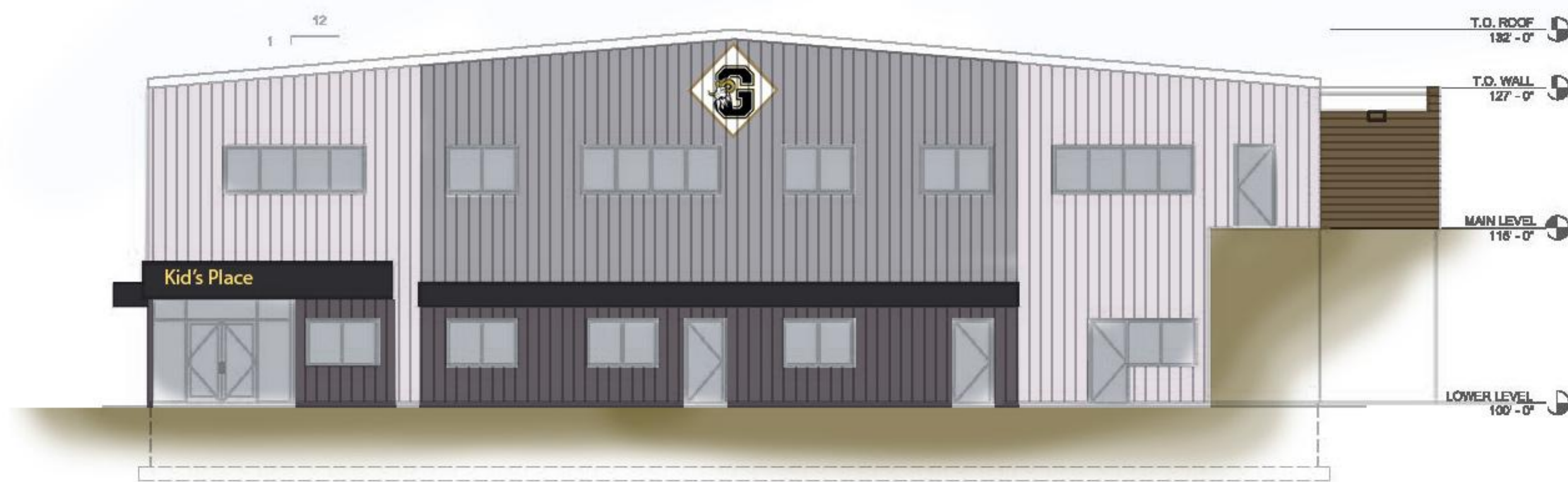
3 WEST ELEVATION 1/8" = 1'-0"